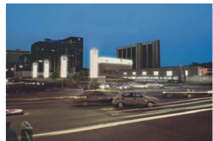
Forecourt and Station Square.

Civil works will construct new curb lines, pavements and surfaces for new sedan taxi waiting areas, two drop-and-go areas for long distance travel services, pedestrian walkways, cycle routes, parking and long distance bus terminal.