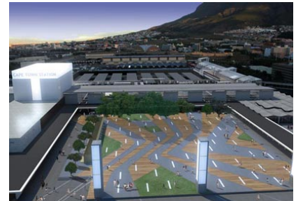
'Open Air Theatre' Forecourt/Station Square

A place that ultimately is a station, though it seeks to reach its potential as one of a number of critical pieces of social and infrastructure in the city, the station is not a unitary device to solve the varying woes of the city, but must play its particular role to a level of excellence in promoting appropriate urban development and performance.