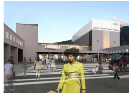
'Creative' Cape Town Space

The long distance bus facility currently in this area will be moved to a new location on Old Marine Drive. This will open the space for creative uses. It will include part of a proposed new rail museum. This will draw local, domestic and international visitors. This space could accommodate an art gallery and other cultural activities. There will be tourist-related retail in this area. The area will also include several restaurants and a convenience store catering to commuters.