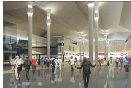
Good Hope Concourse

The Parade Concourse will cater to rail commuters. There will also be a number of retail opportunities available in the Parade Concourse.