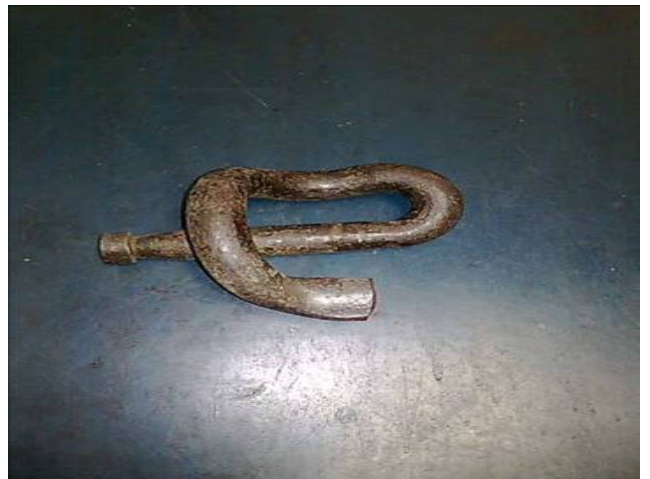
Rail track clips damaged