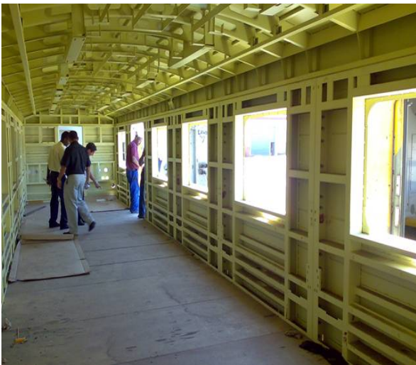
Coaches are being reconstructed and refurbished