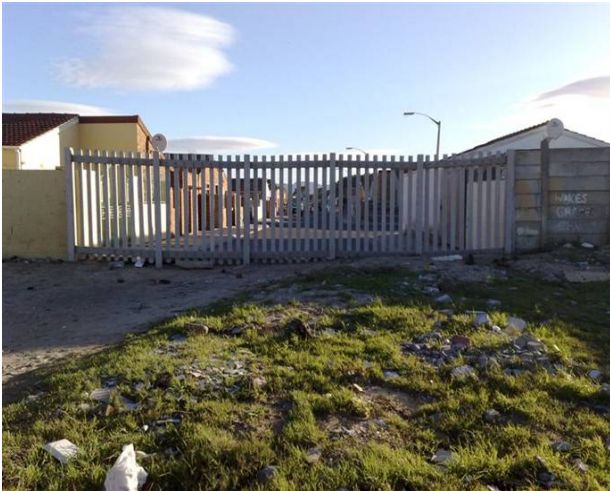
Fences are being replaced