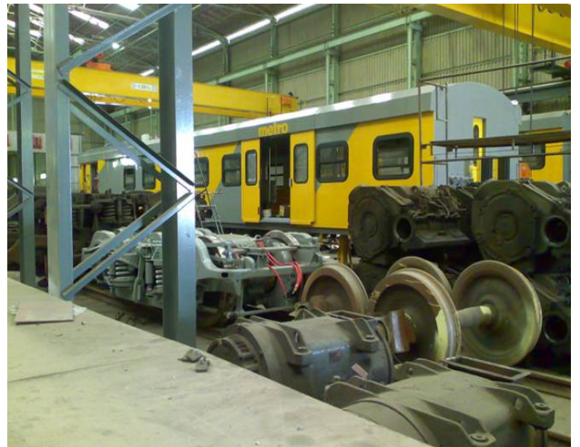
Exterior refurbished carriage in depot