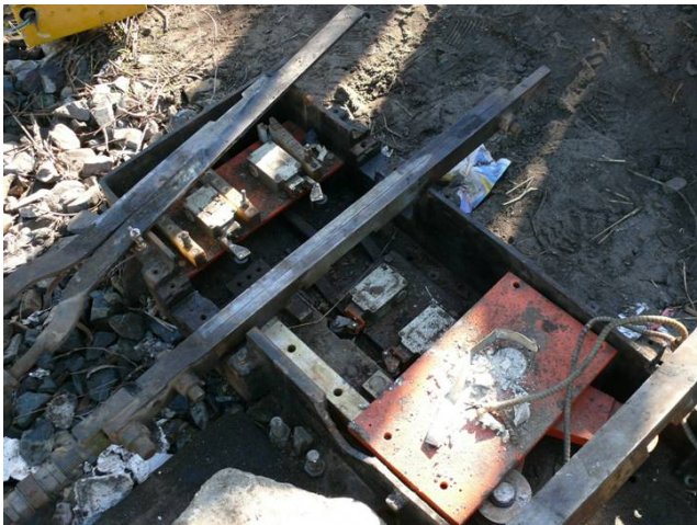
Signal points damaged