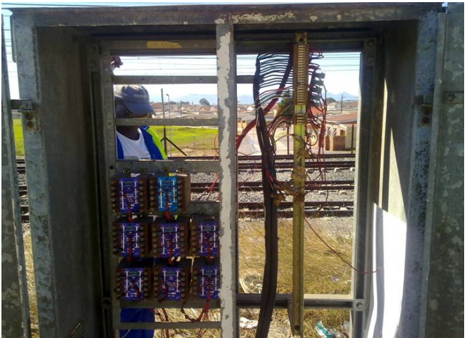
Signal box opened and electrical wiring damaged and removed