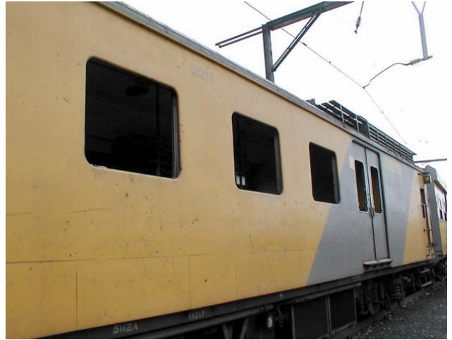
Windows being removed from coaches