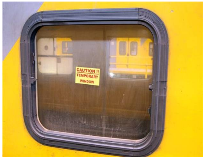
Temporary windows are fixed as an interim solution