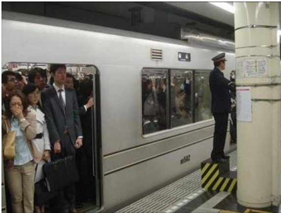
Tokyo commuter rush