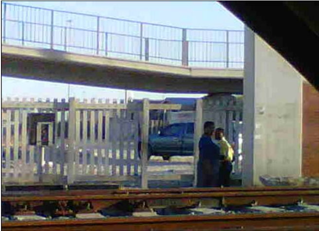
Fences surrounding stations are damaged