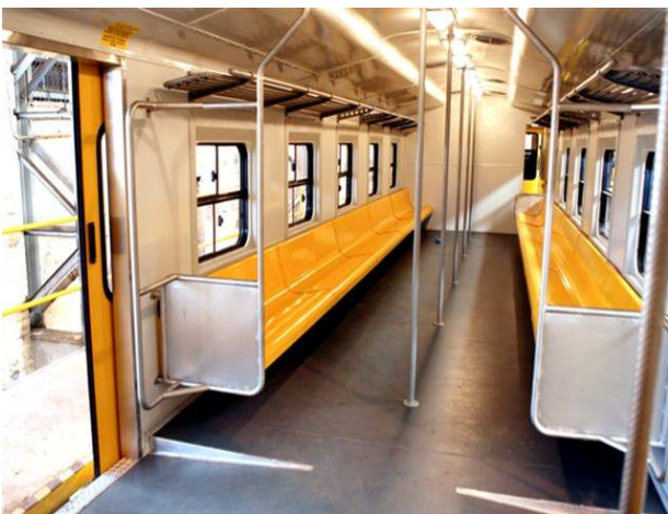
Interior of coaches being refurbished