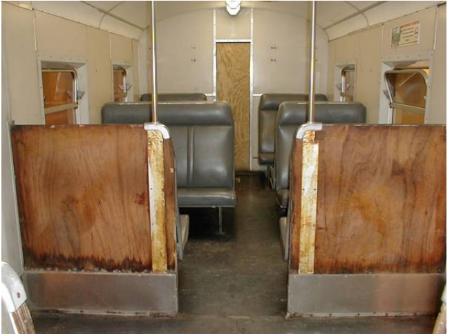
Metrorail coaches where seats have been removed