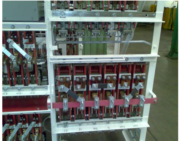
Signals and electronic equipment are being replaced