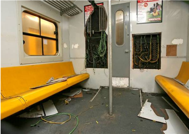
Cables ripped out and interior damaged