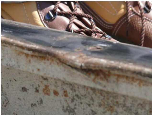
Rail track damaged