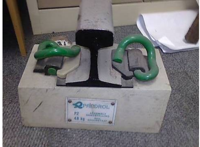
Brand new rail clips