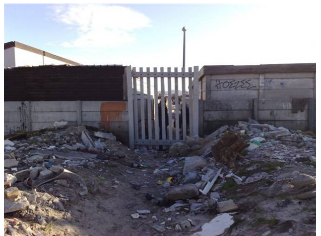
Fences are being repaired