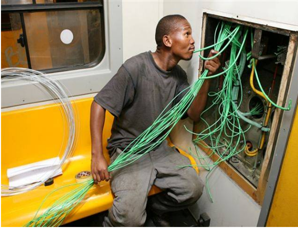
Cables being replaced