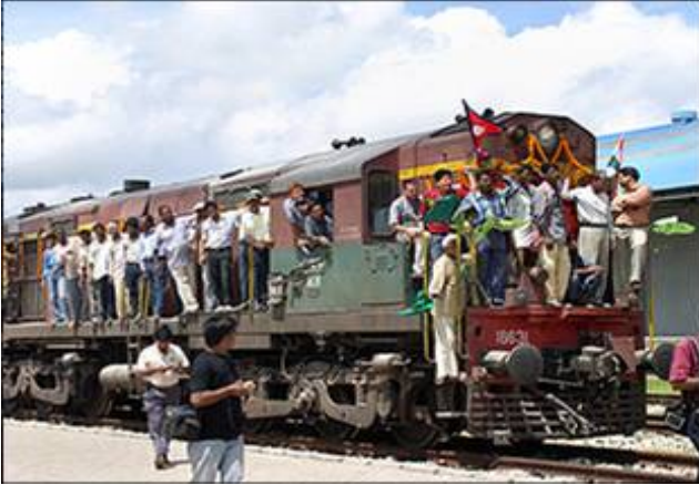
A day in the life of Indian commuters