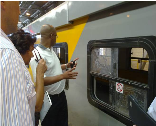
Composite windows replaced