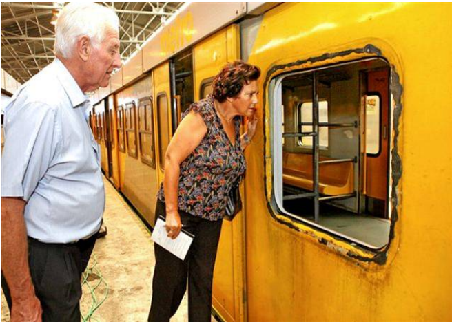
Stakeholders visit a depot to inspect damages to trains