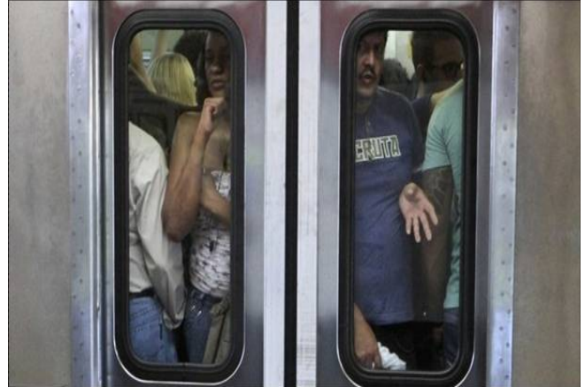
Sao Paolo Brazil rush hour