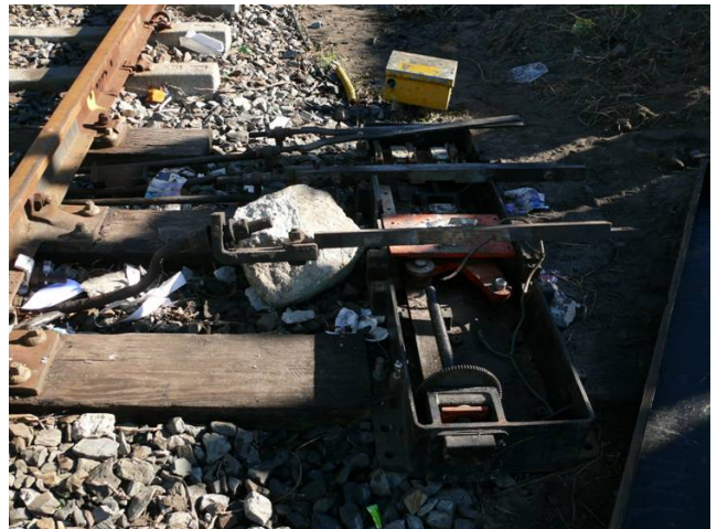
Signal points deliberately damaged