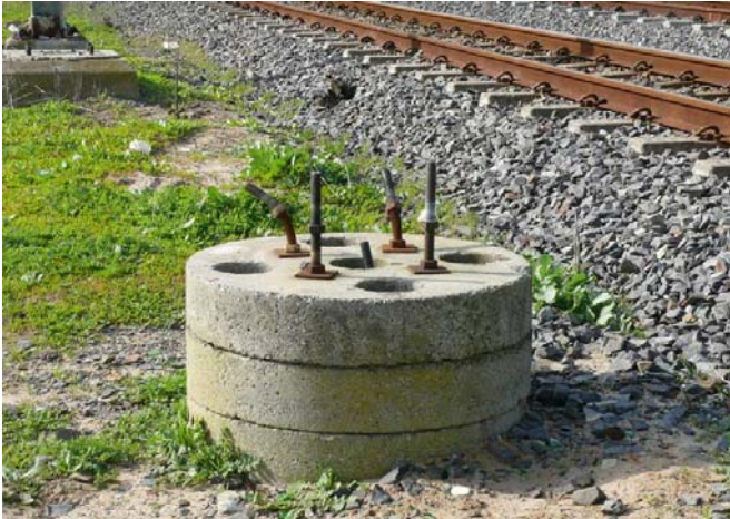
Signals removed (Belhar)